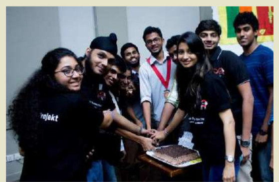
Celebrating signing the twin club agreement

Organizing committees of successful signature projects such as 'Are You Ready? 2016', 'Hand in Hand' were felicitated at the General meetings. Some special celebrations such as member birthday celebrations etc. too takes place after meetings.