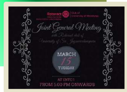
General Meeting fb flyer